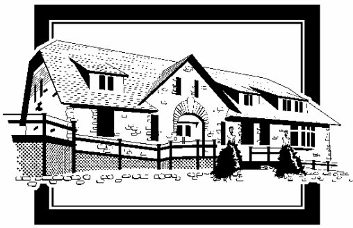
Camp Easter Seal