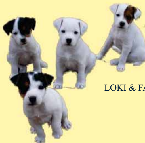
LOKI & FAMILY